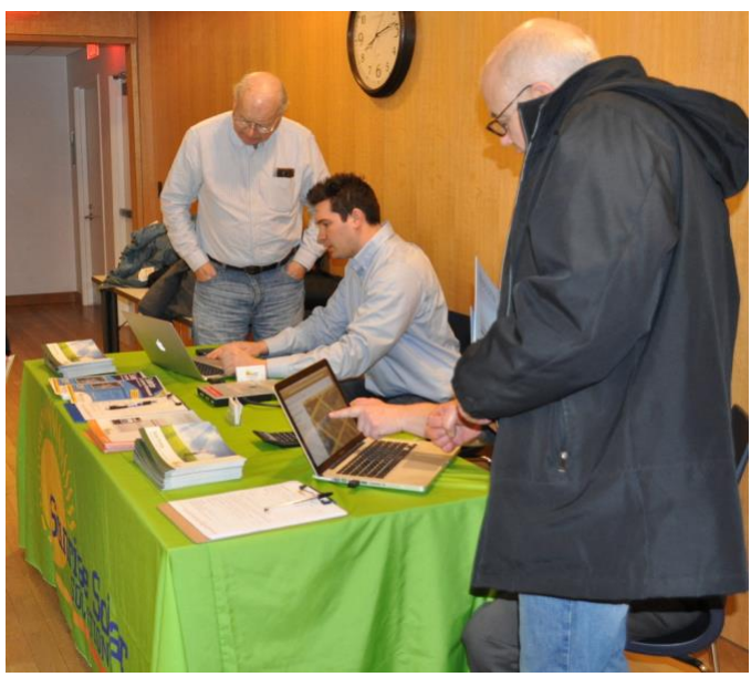
Homeowners get a preview assessment of their solar potential via satellite, with Sunrise Solar staff At Green Steps Expo at Larchmont Temple on March 22, residents sign up with Sunrise Solar for a free site assessment