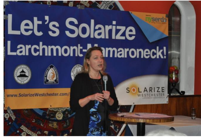
Westchester County Legislator Catherine Parker