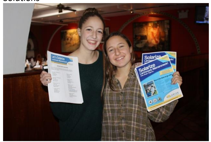
Students helped spread the word