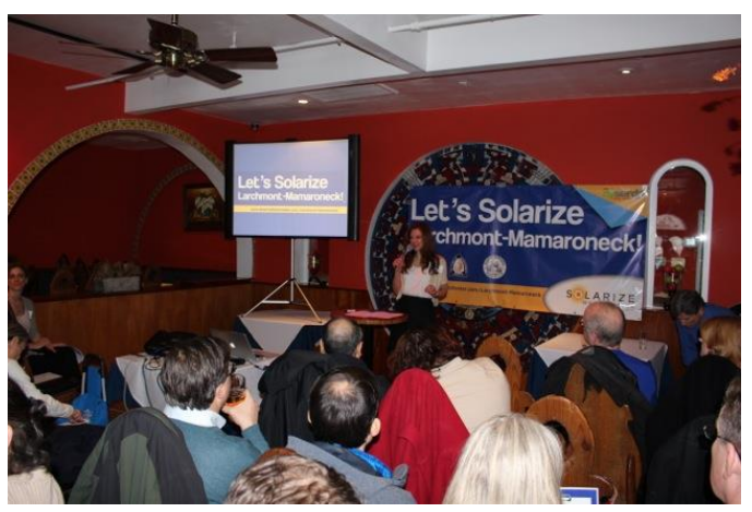
Over 100 people attended the event at Tequila Sunrise