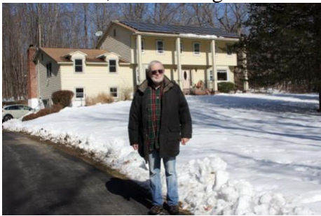
Cole home, Lewisboro