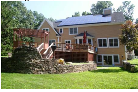
Housman home, Lewisboro