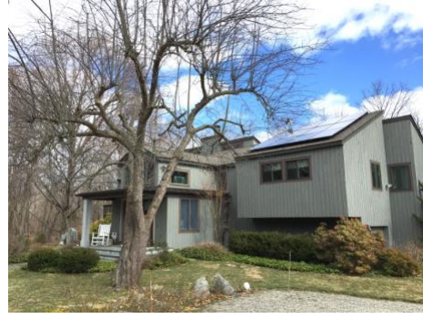
Sears home, Pound Ridge