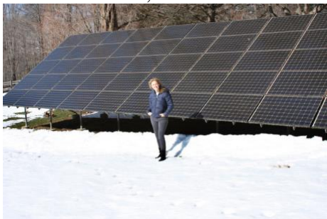
Harckham ground mount, Lewisboro