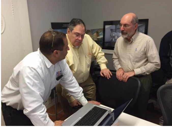
Using satellite imagery to check a building's solar potential