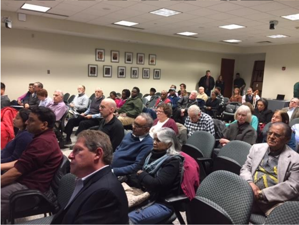
Solarize Greenburgh launched with a program at Greenburgh Town Hall on March 21! To see a full video of the launch event, go to http://greenburghny.swagit.com/play/03242017-620/1/ .