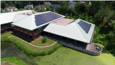
Solar system on Town Hall from the air