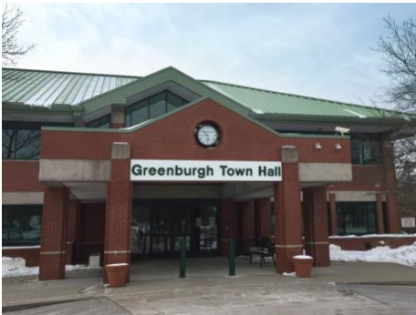
Greenburgh Town Hall