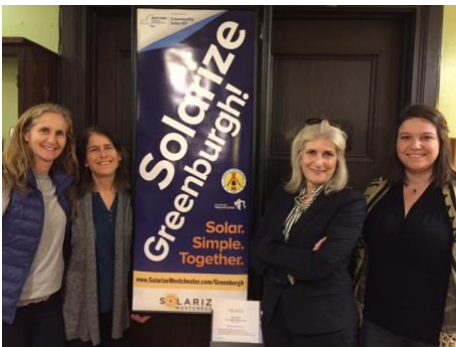
The Greenburgh Nature Center hosted a Solarize Greenburgh workshop on March 29.