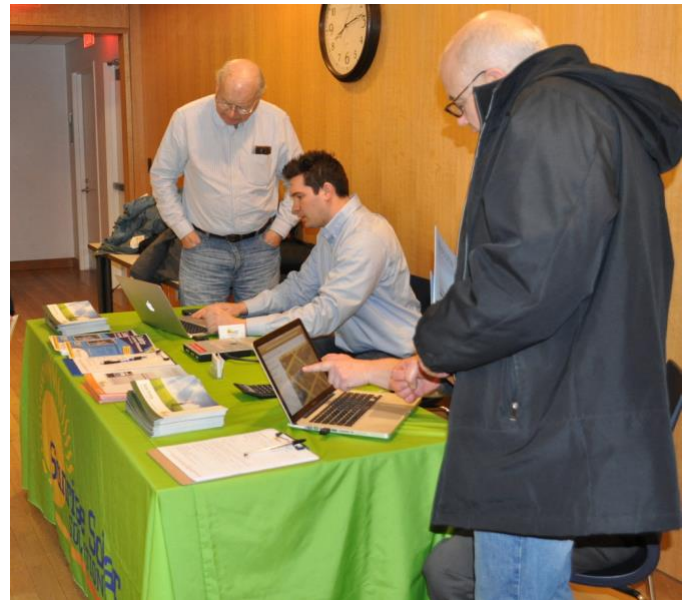
Homeowners get a preview assessment of their solar potential via satellite, with Sunrise Solar staff At Green Steps Expo at Larchmont Temple on March 22, residents sign up with Sunrise Solar for a free site assessment