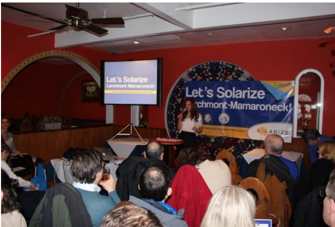
Over 100 people attended the event at Tequila Sunrise