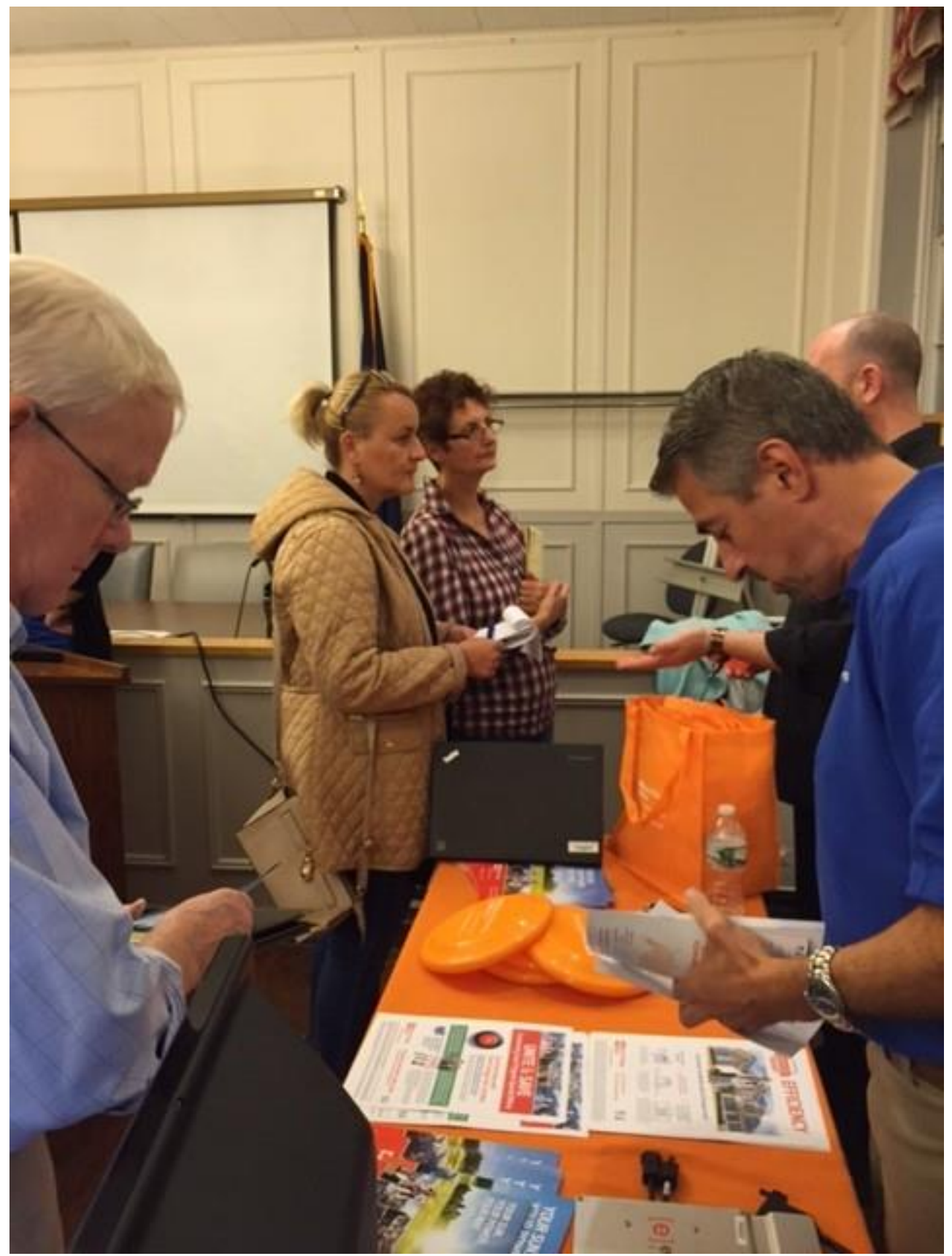
Somers residents speak with representatives of Direct Energy Solar at Somers launch event