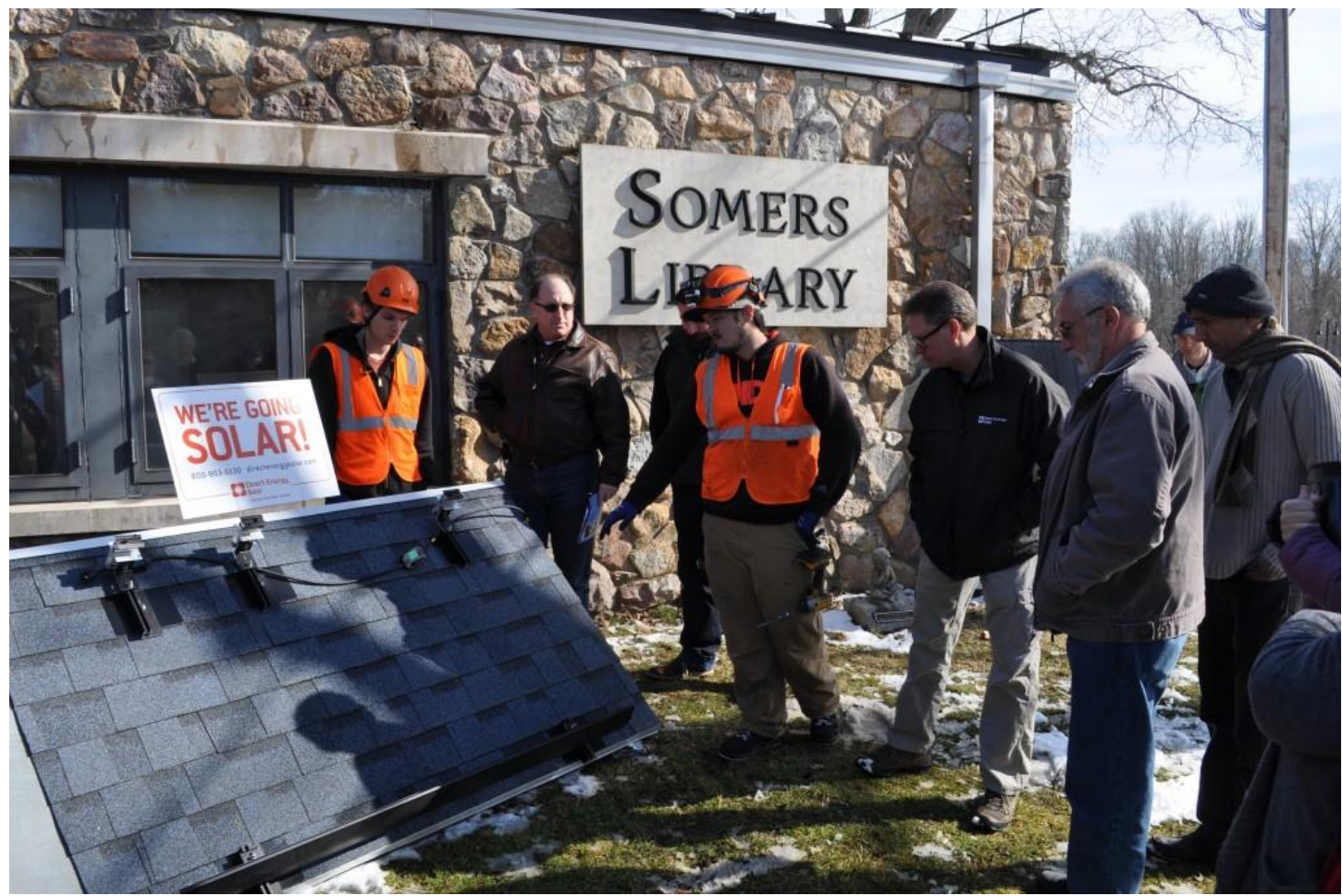
At the February 6 Solarize Workshop at Somers Library, a solar installation demo was performed by installers from Direct Energy Solar, the selected residential installer for Solarize Somers-New Castle.