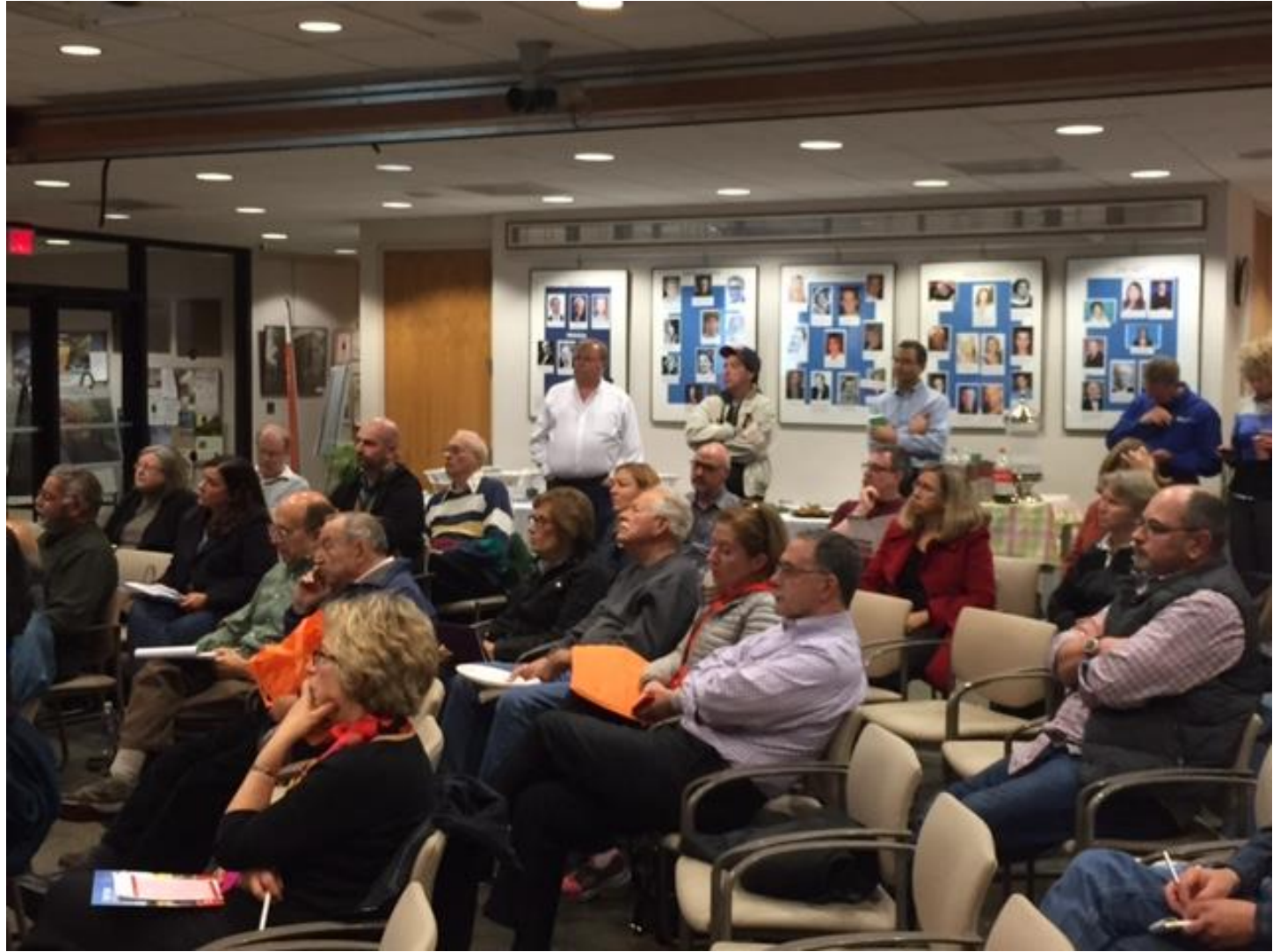
Oct. 26 launch event at New Castle Town Hall