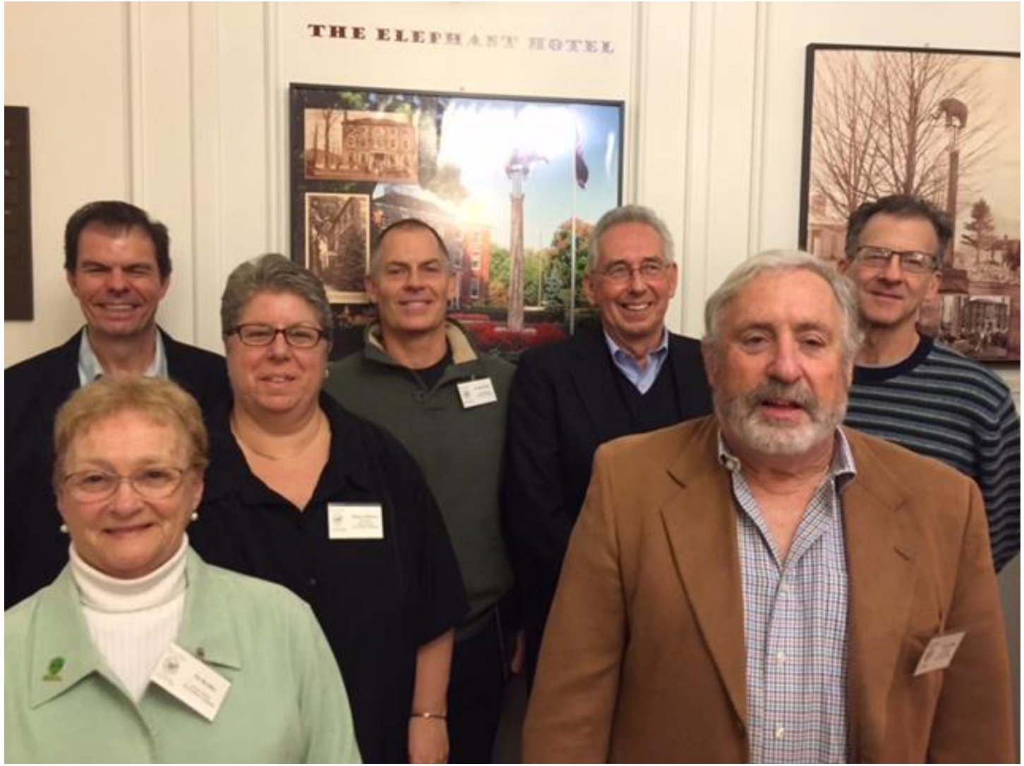
Leaders of the Solarize Somers campaign