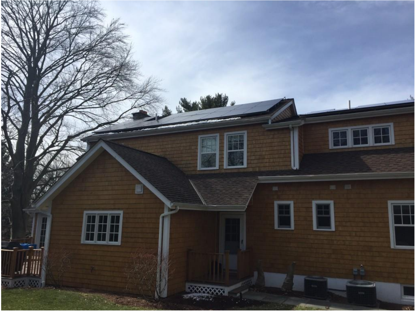
One of the first Solarize New Castle installations completed...